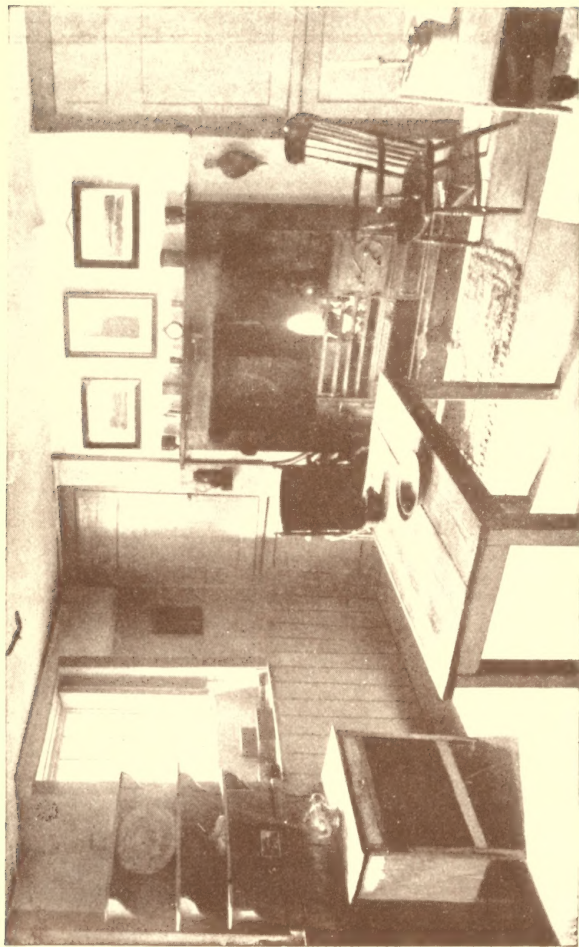
A room in Carlyle's House in Cheyne Row, London